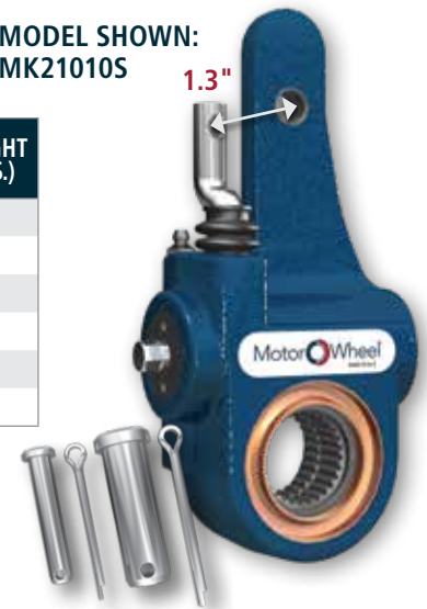
MODEL SHOWN: MK21010S

Actual product performance may vary depending upon vehicle configuration, operation, service and other factors. All applications must comply with applicable specifications from Motor Wheel and the respective vehicle manufacturer. Contact Motor Wheel for additional details regarding specifications, applications, capacities, and operation, service and maintenance instructions.