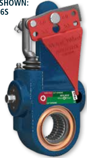
MODEL SHOWN: MK42106S