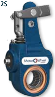
MODEL SHOWN: MK25102S