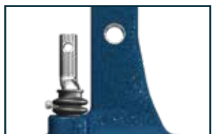
Silver lift rod for easy identification