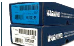
Blue box label for easy identification

NOTE: 1.3" Pin Spacing is typical of welded clevis applications used on International, Freightliner, Mack and Volvo trucks.