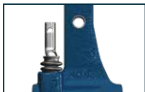
Silver lift rod for easy identification