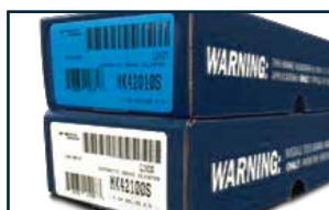
Blue box label for easy identification

NOTE: 1.3" Pin Spacing is typical of welded clevis applications used on International, Freightliner, Mack and Volvo trucks.