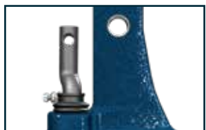
Silver lift rod for easy identification