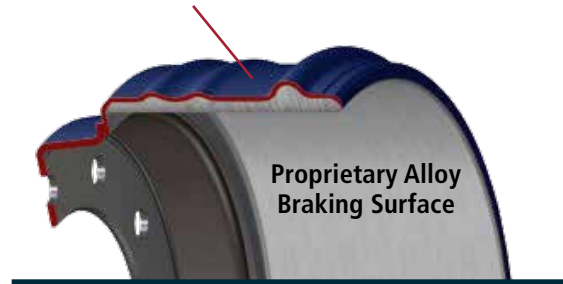
Steel Shell for Enhanced Performance

Save up to 232 pounds using CentriFuse Lite. Increase miles per gallon and/or revenue-producing payload.