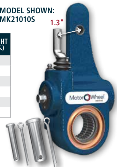
MODEL SHOWN: MK21010S

Actual product performance may vary depending upon vehicle configuration, operation, service and other factors. All applications must comply with applicable specifications from Motor Wheel and the respective vehicle manufacturer. Contact Motor Wheel for additional details regarding specifications, applications, capacities, and operation, service and maintenance instructions.