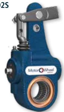
MODEL SHOWN: MK25102S